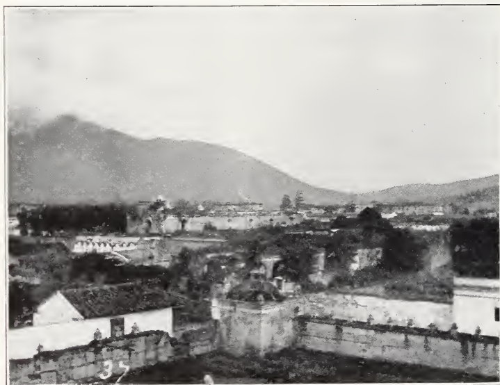
Ruins of Antigua, Guatemala.